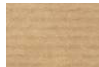
b: Mat brown kraft paper