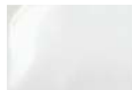
c: Shiny couche paper (mostly used)