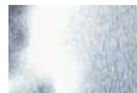
d: Silver PET