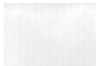
a: Mat white kraft paper