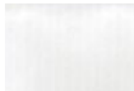
a: Mat white kraft paper