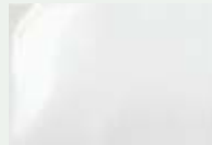
c: Shiny couche paper (mostly used)