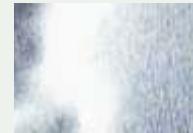
d: Silver PET

other materials not available for this size