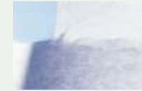
Cellulose paper 40 gr/m2 app. 120 x 205 mm

other materials not available for this size