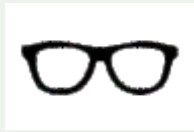
optical lens cleaning wipes